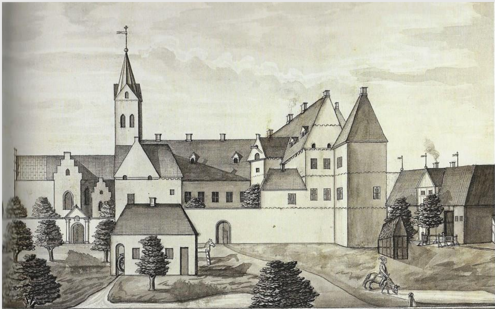
Prospect of Dronning Lynd. at se fra den Nordre Side. 1734.